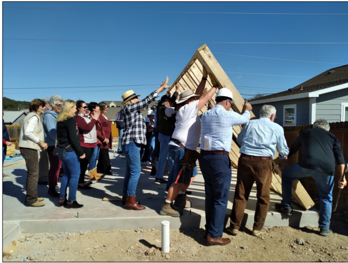
Habitat House, a ministry of Mission and Outreach

tions, including both operating and special fund accounts. A report of these records will be made at monthly session meetings.