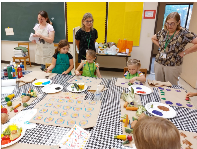
Vacation Bible School, a ministry of Christian Formation

ADMINISTRATIVE SERVICES: This area is composed of three committees. Planning & Training is responsible for identifying church leadership via its