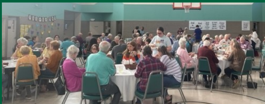
We had over 120 in attendance for our first All Church Dinner in March.