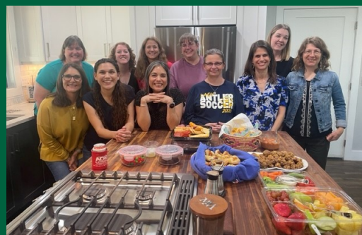
Fellowship 1 Bunco Night